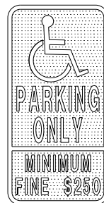
SIGN R99C (CA) See Note 3