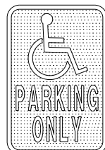
SIGN R99 (CA)